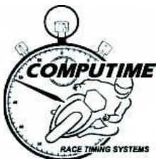
Clerk of Course - Tom Williams

Computime Race Timing Systems Pty Ltd © 1996-2008