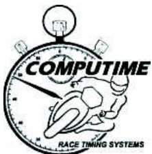
Clerk of Course - Tom Williams

Computime Race Timing Systems Pty Ltd © 1996-2008